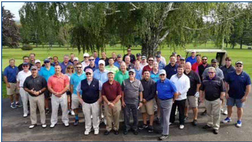
CFDA Members, Vendors and Friends at the 2018 Tournament.

To Advance the Profession of Funeral Service in Connecticut through Public Awareness, Education, Advocacy and High Ethical Standards.